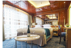
Main Deck Suite