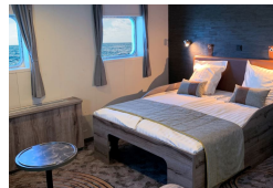
Triple Porthole Twin Deluxe Twin Porthole Twin Window