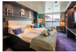
Quadruple Porthole Superior