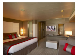
Grand Deluxe Suite