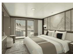
Grand Veranda Suite