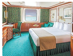
Category 3 Solo