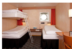
Cat 2 - Twin