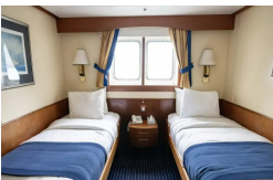
Owners Suite Superior