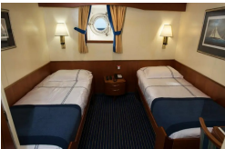
Main Deck Twin Porthole