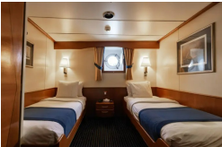
Main Deck Twin Window