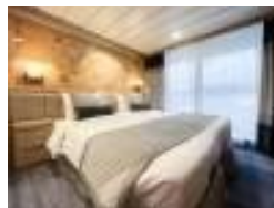
Deluxe Veranda Forward Stateroom