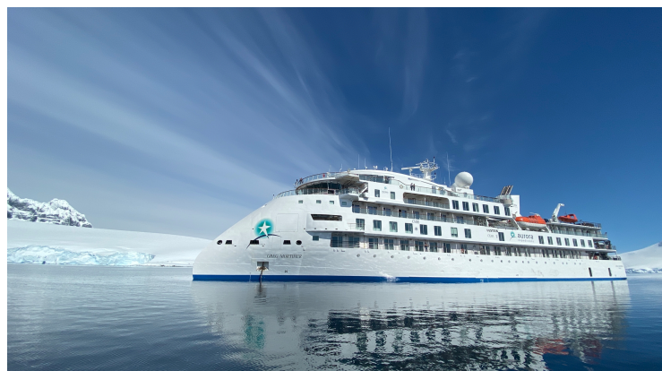
on Deck 5.