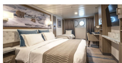
Aurora Stateroom Triple Share