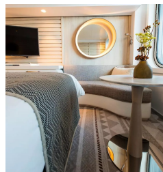
Deluxe Suite Deck 3