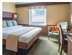
Category 4. From