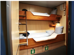
Twin Private Porthole