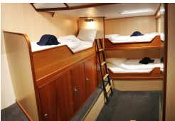
Twin Private Inside