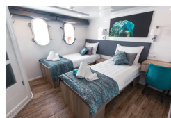
Upper Deck Cabin with Balcony