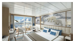
Balcony Stateroom Category A