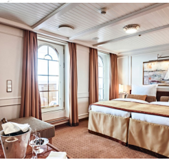
Category B. From