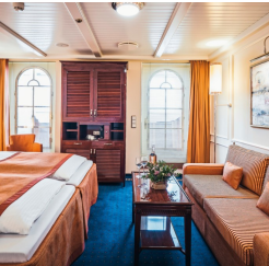
Category C. From