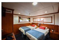
Category C USA price